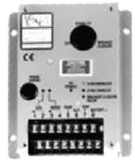
Synchronizer Type SYC 6714