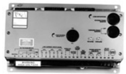
Load Sharer Type LSM 672